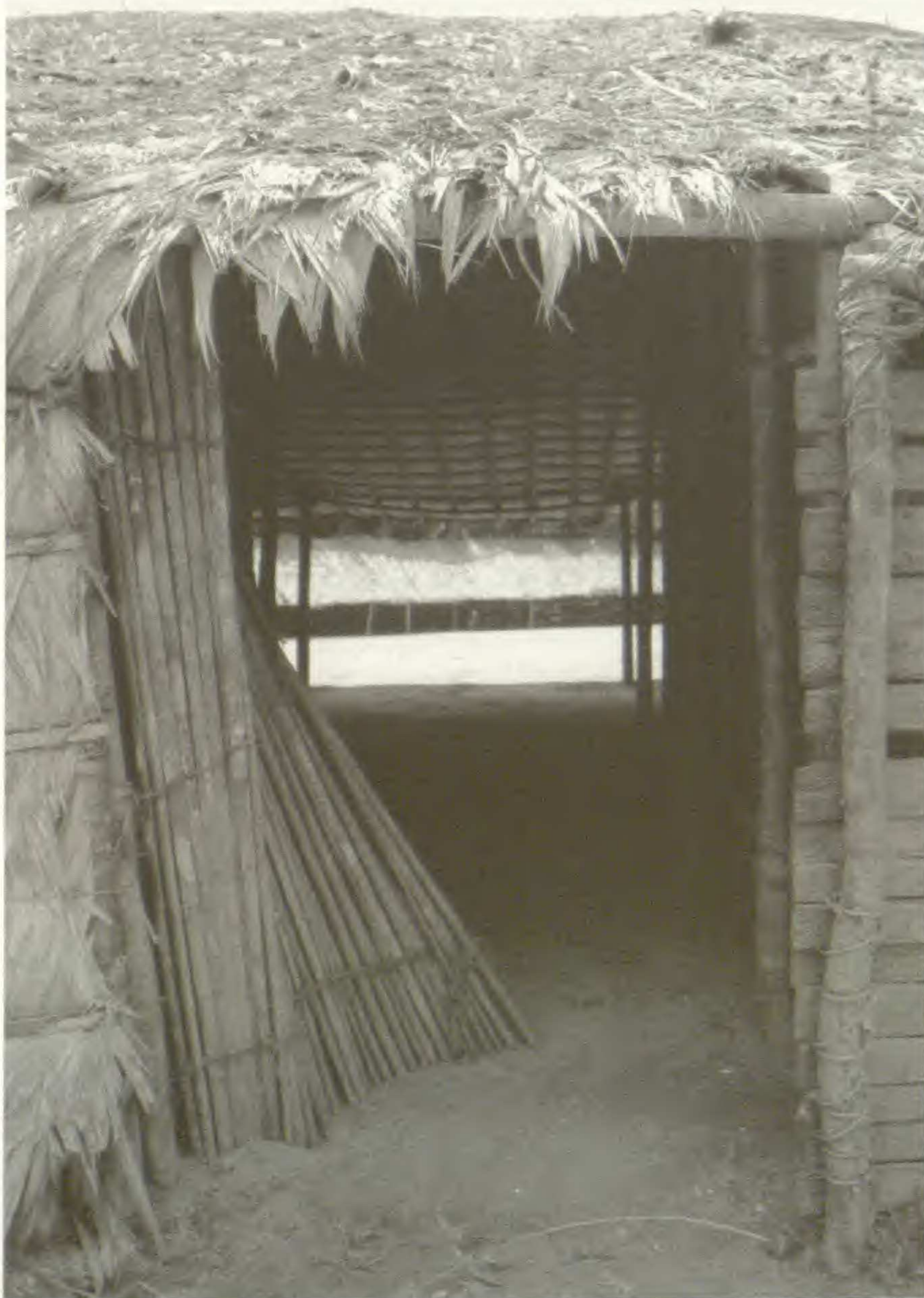
FIGURE 3.—Detail of one of the main doors ( pata yoka ) at Watoriki , looking inwards. Note the thatched wall on the left, the Socratea -wood wall on the right, and the folding door (also made from Socratea wood).

The yano at Watoriki consists of a covered ring-shaped structure approximately 80 m in diameter, walled on the outside and open on the inside (Figure 2). It is built in a clearing ( yano a roxi ) large enough to ensure that the tallest trees in the adjacent forest will not cause damage if they fall. At the centre of the yano is a large open space ( yano a miamo ). The Yanomami live in family groups scattered around the ring, each of which has its own cooking fire about which the hammocks are positioned. This conforms essentially to the typical layout of an open Yanomami round-house ( yano mat h a ), as described and illustrated by Chagnon (1968), Fuerst (1967), and Lizot (1984). Houses vary in size but are always round, so the size of the opening in the centre ( yano kahiki or " yano's mouth") necessarily increases as the diameter of the house increases. In the smallest "closed" houses ( yano komi ), this is reduced to a small smoke-hole at the centre, sometimes capped by a type of thatched chimney. The topmost point of a yano komi is known as the yano oraka .